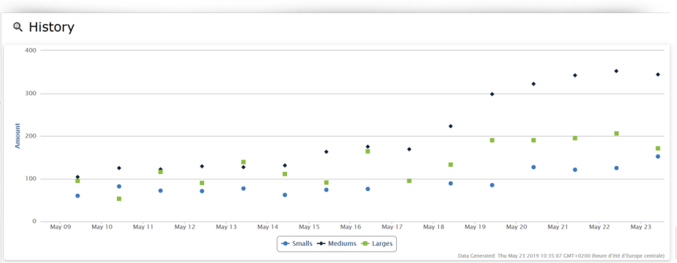
EXAMPLE OF INSECT ACTIVITY