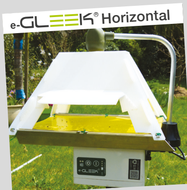
e-GL EEK ® Horizontal