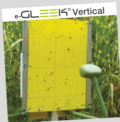
e-GL EEK ® Vertical