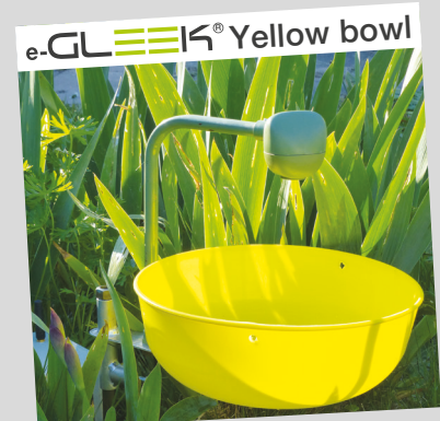
e-GL EEK ® Yellow bowl